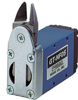
NF05 - Stationary Nipper

The Vessel GT-NF series nippers are very similar to the GT-NY nippers, but do not include the sliding feature. These nippers are lightweight, compact, and have mounting holes on three surfaces. The low profile of these nippers makes the NF series an excellent choice for end-of-arm tooling and robot mounting.